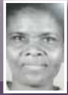
SOME OF ELDICA'S GENERATION