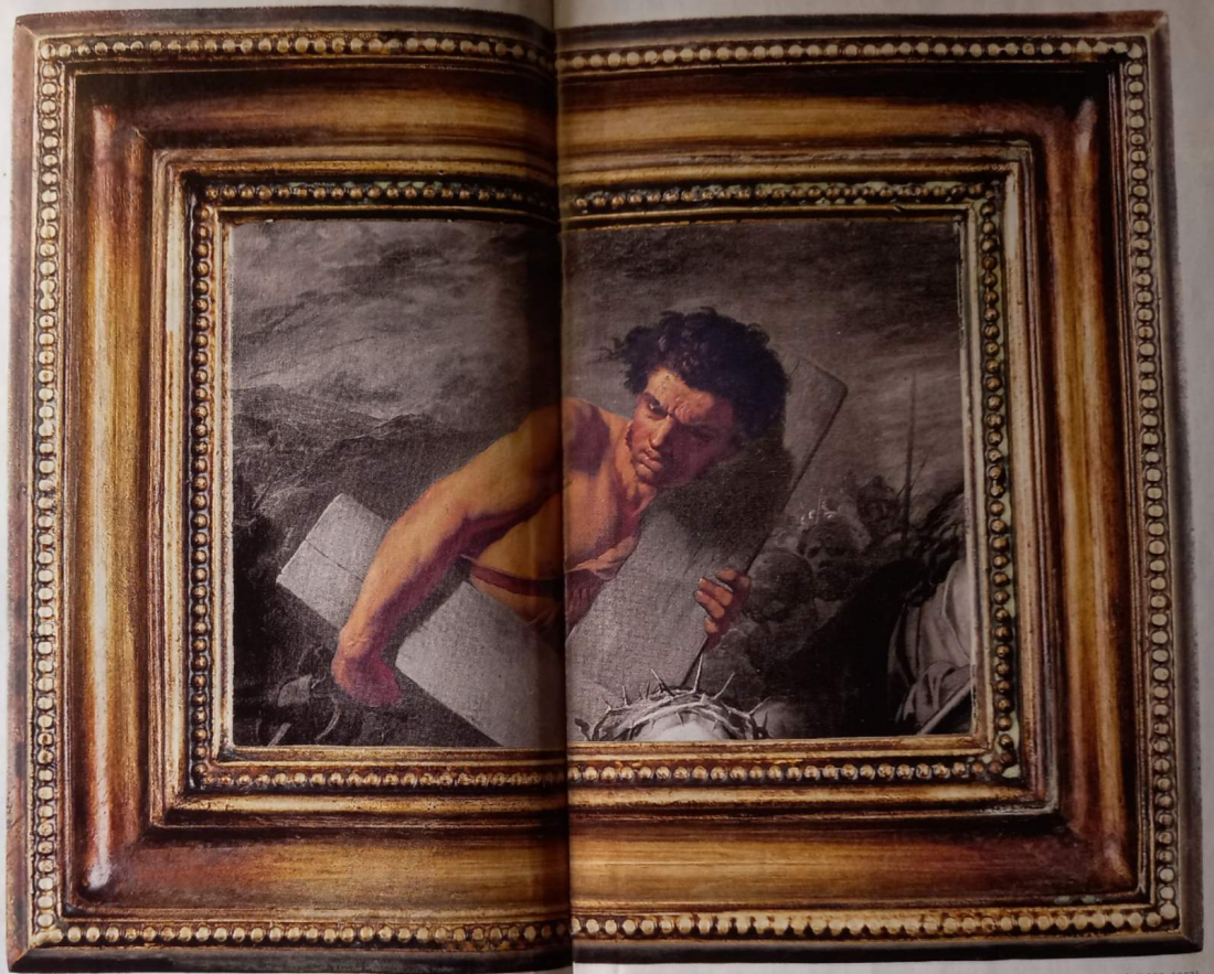
"Simon of Cyrene helps Jesus to carry His cross," detail from a painting by Jan Van Eyck (1809-1853) Van Eyck painted 14 pieces dedicated to the passion of Christ.

stone wall that encircled Jerusalem. The air was fresh with the smell of dissipating dew; passing his nostrils before being sucked up by the sun, coyly giving a glimpse of its warmer personality before blazing in a burst of terrifying glory; even as the Son, would have His face marred and His body scarred before being sentenced to the earth by the very persons who